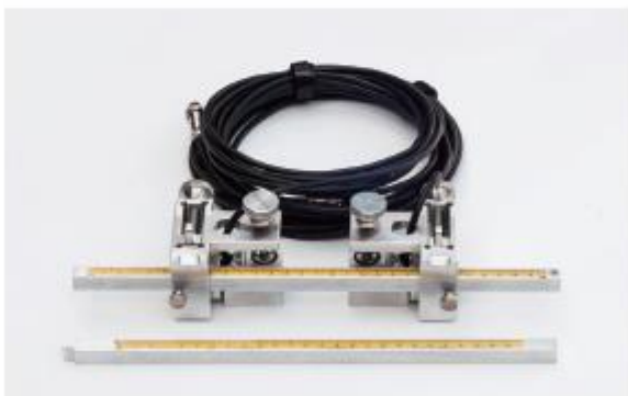
Single guide mounting type bracket ( Code ST )