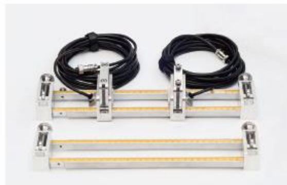
Dual guides mounting type bracket ( Code DT )